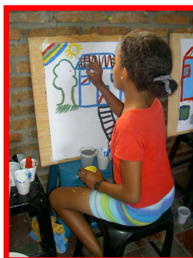
Painting workshop for children – Compartir association - Honduras