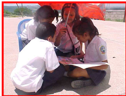
Children from the Reading Club of the Compartir Association-Honduras