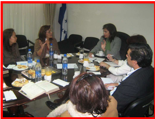
Meeting with the Minister of Employment and Social Affairs of the Republic of Honduras.

Below, you will find a description of the main outcomes of the event. First there is a short description of the participating organizations. Then there is a summary of the experiences of organizations working against child labour in each country. Finally, you will find a summary of successful strategies, lessons learned, and points of similarity and difference in approaches to child labour.