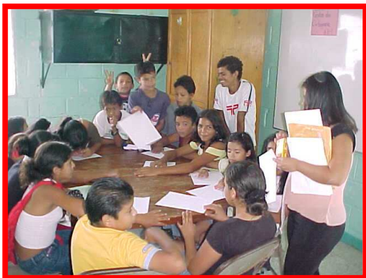
Readers' Club from the Compartir Association, Honduras