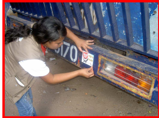
Awareness-raising campaign against child labour, carried out by children putting stickers on vehicles in the city of Tegucigalpa, Honduras.

One of the most important results of this event was the Declaration of Honduras for the Eradication of Child Labour (appendix 2), which established an important precedent and formed the basis for a regional action plan to stop child labour.