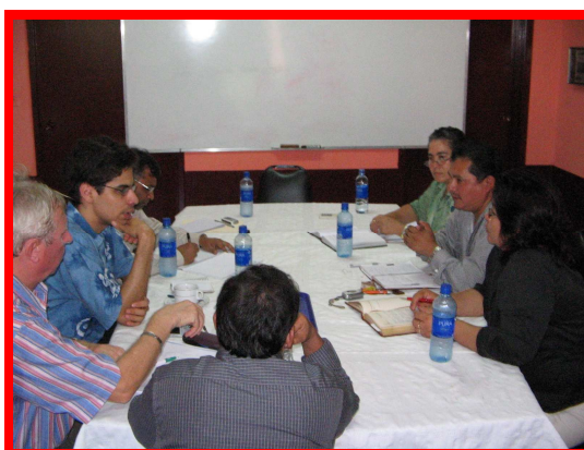
Personnel of the Union of Albania and MVF, in a meeting with the Teachers' Union ANDEN-Nicaragua