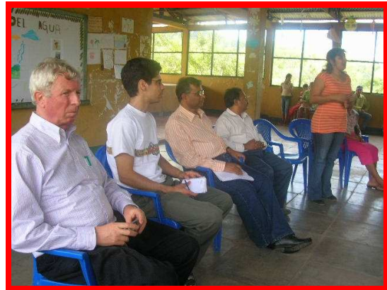
Exchange between MVF and the Teachers Union of Albania with beneficiaries of INPRHU-Somoto, Nicaragua

Overall it was agreed that the eradication of child labour does not need to wait for poverty alleviation. Indeed, the success of the program for eradication of child labour lays in resonating with the demand of the poor for educating their children as a non-negotiable principle. In order to realize structural change it remains important to work through existing institutions and build community pressure/support to strengthen these institutions and their capacities to ensure that they commit themselves to protection of child rights and education.