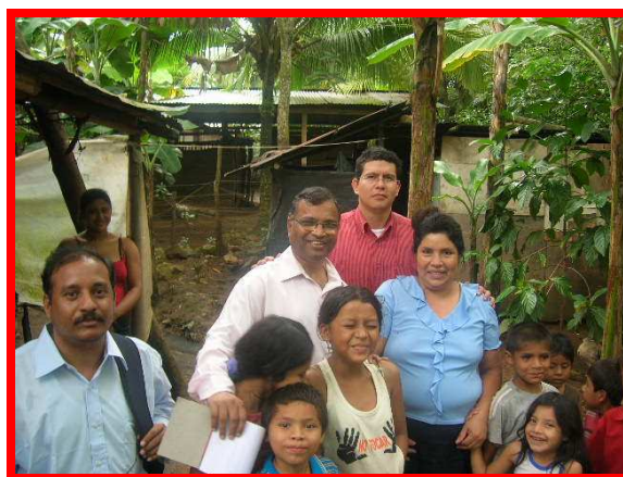
Employees of MVF visiting communities and families in Nicaragua.

The Albanian Teachers Union is convinced that "the unions should protect the rights of the teachers and the teachers should assert the rights of boys and girls" .