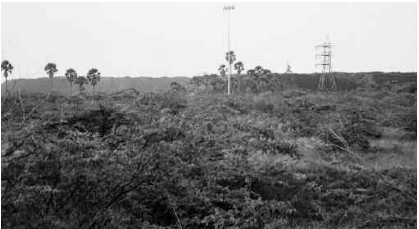
Thousands of tonnes of arsenic-laden slag, open to the wind, visible behind scrubland at the Tuticorin smelter (April 2005).

From: Show Cause Notice to Sterlite Industries, Tuticorin, April 2005