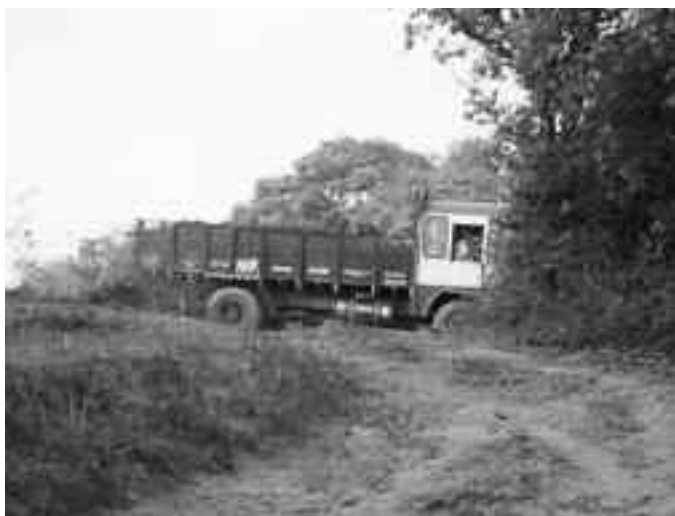
A Vedanta truck leaves the Balmadies coffee plantation, uncovered and spraying silica-laden bauxite dust on children returning from school.

Exasperated by these procrastinations and Vedanta's illegal actions, in late July 2005 the SCMC drafted an order to shut down the smelter for "fully violating the Hazardous Waste Rules 1989 and the order of the Apex court dated 14-10-2003 and the consent of the Tamil Nadu Pollution Control Board (TNPCB)."