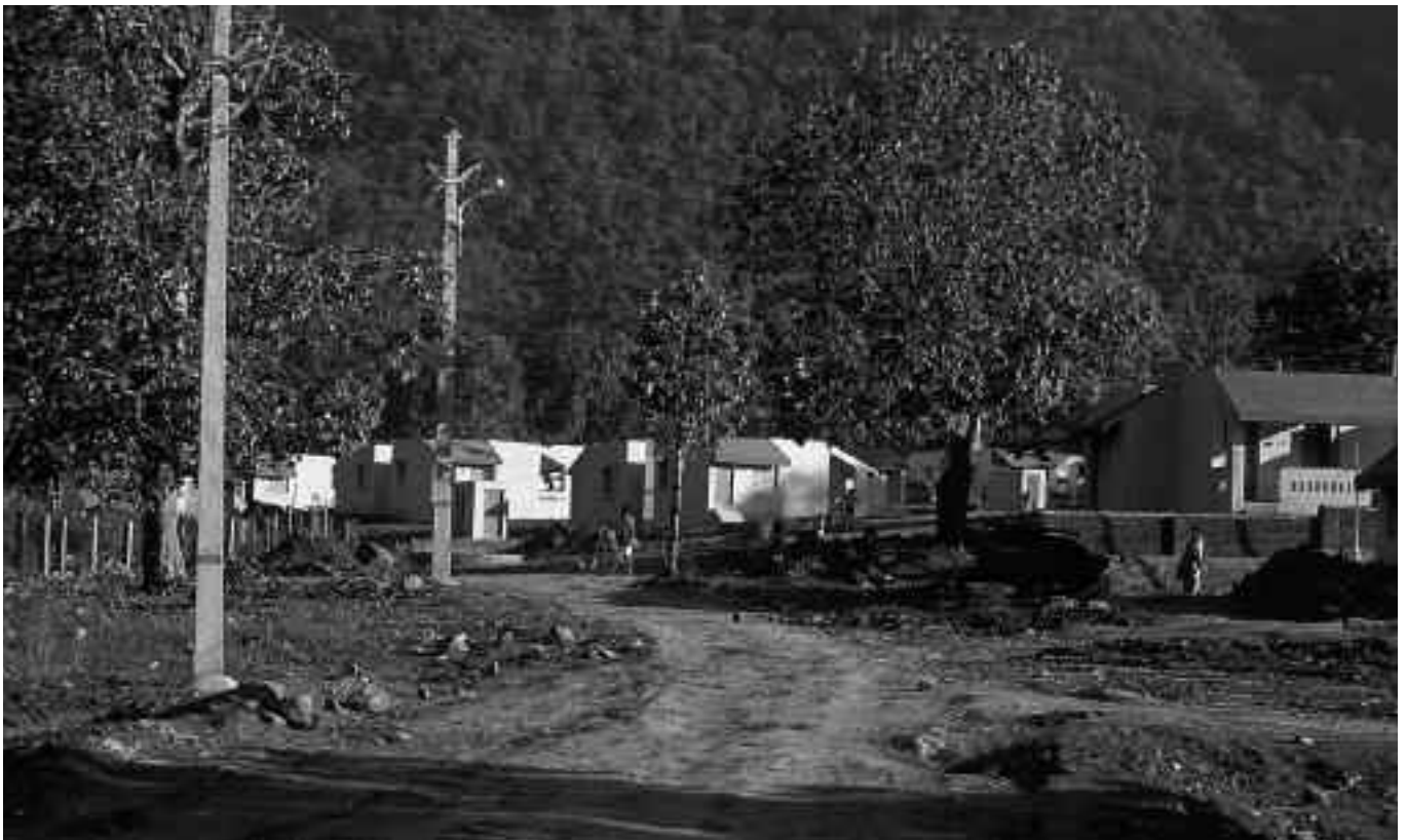
The "resettlement" colony at Lanjigarh with the Niyamgir hills behind.