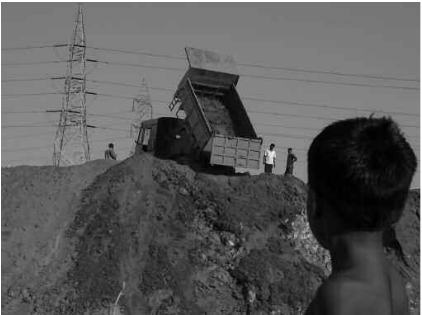
A child observing red mud being dumped near the Stanley Reservoir, at Mettur.