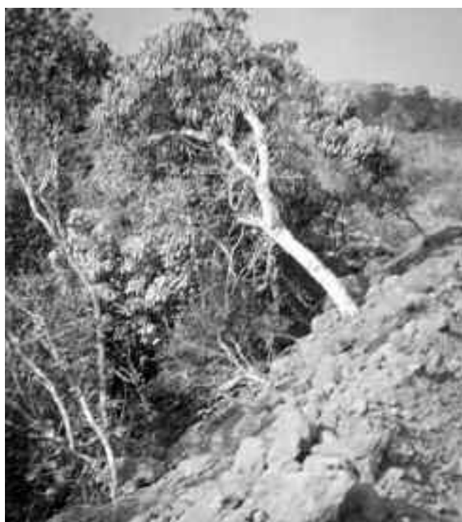
An un-reclaimed pit and waste rock dump belonging to Vedanta just above farm land in the Kolli Hills, Tamil Nadu