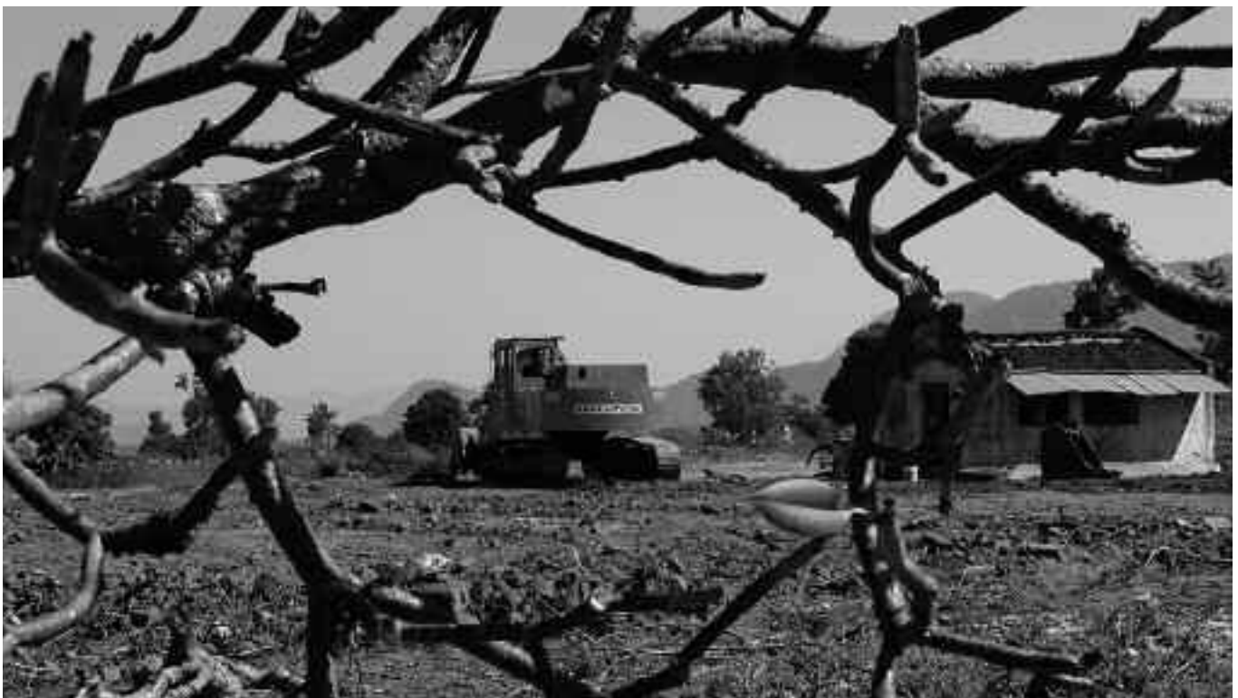
Not so long ago there were people in Kinari. Now it is part of Vedanta's Lanjigarh refinery

As confirmed in a July 2005 study by The Environment Protection Group Orissa (EPGO), the entire Nyamgiri deposit lies atop of a protected forest area which is home to a variety of rare and threatened fauna and flora. Their diversity is scarcely equaled in the rest of south Asia and includes thirty medicinal plants, at least fifteen kinds of epiphytic orchid, twenty wild ornamental plants, more than ten kinds of wild relatives of crop plants (including some protected under an international undertaking), tigers, leopards, elephants, sloth bears, palm civet, and other animals, many of which are listed as endangered by the International Union for the Conservation of Nature (IUCN). There are also rare birds, the unique Golden Gecko lizard and wild snakes including a rare type of viper.*