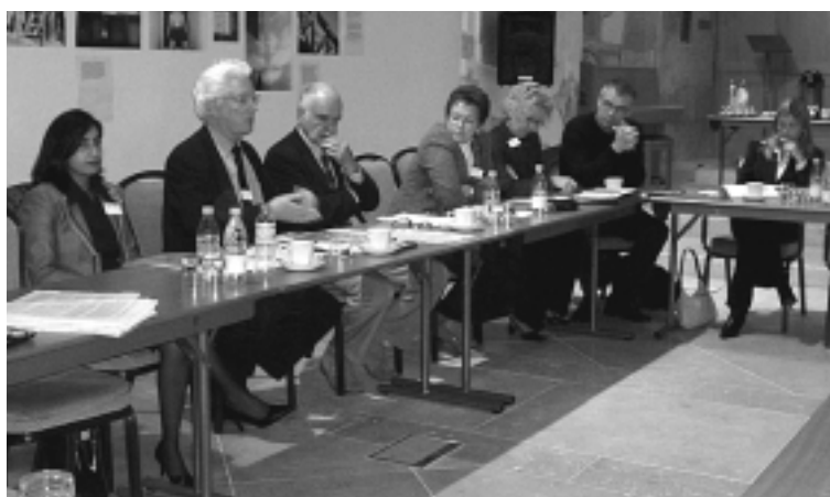
DSN Employment Principles Seminar 22 nd Sept 2004