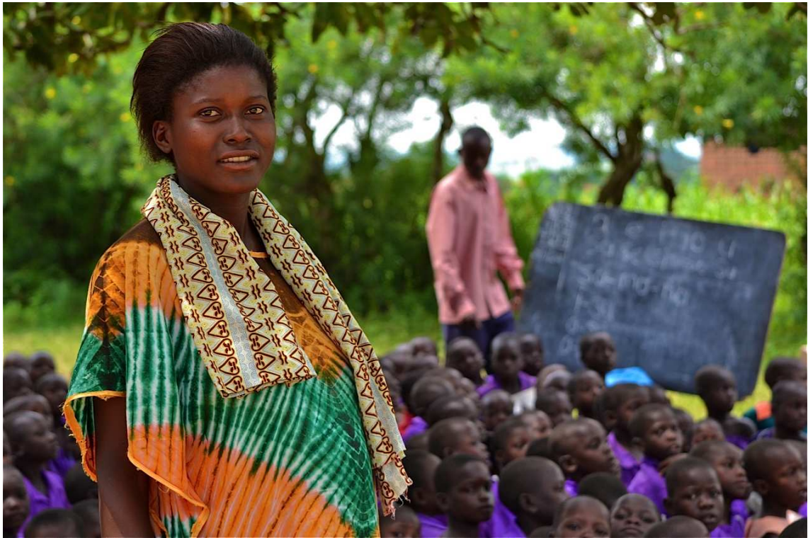
Key stakeholders include teachers, parents, youth groups, community members and women groups.