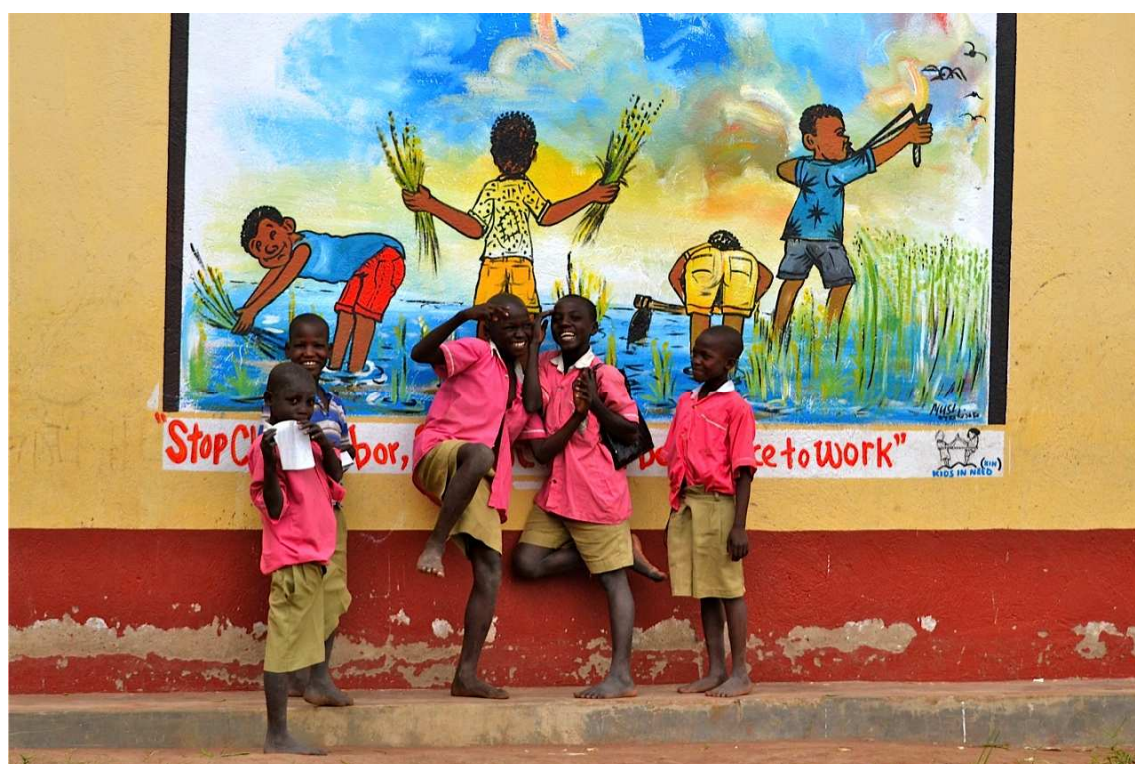
Wall painting at school in Doho rice scheme