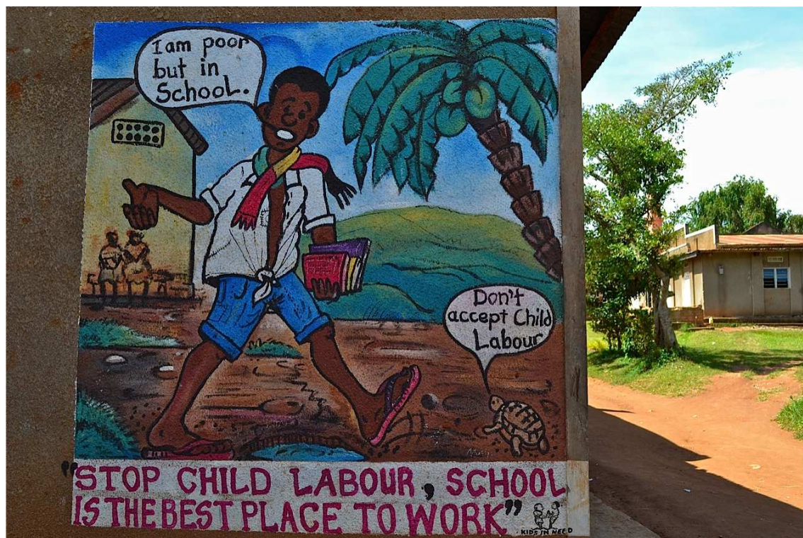
Wall painting at UMEA primary school in Kitubulu Village